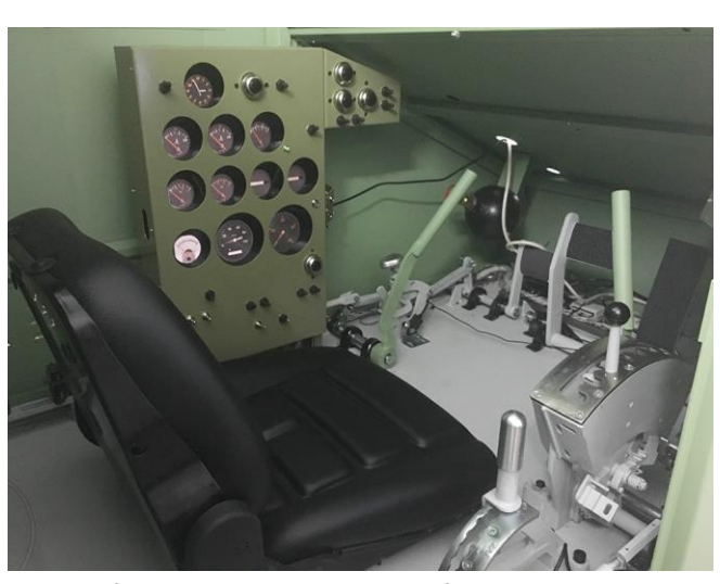
Interior of tank driver compartment of tank M-84 simulator