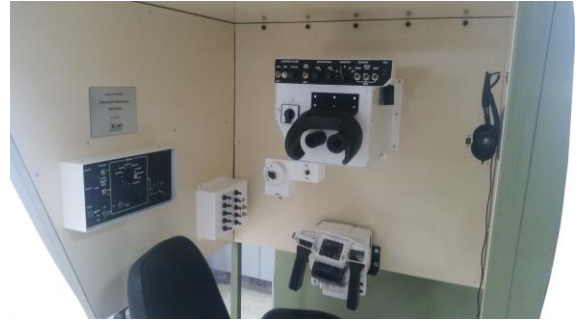
Gunner's cabin M-84 simulator