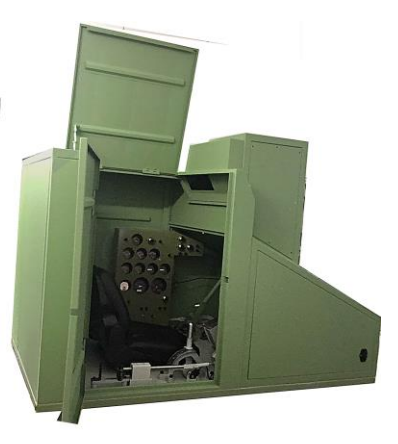
Tank gunner compartment of tank M-84 simulator