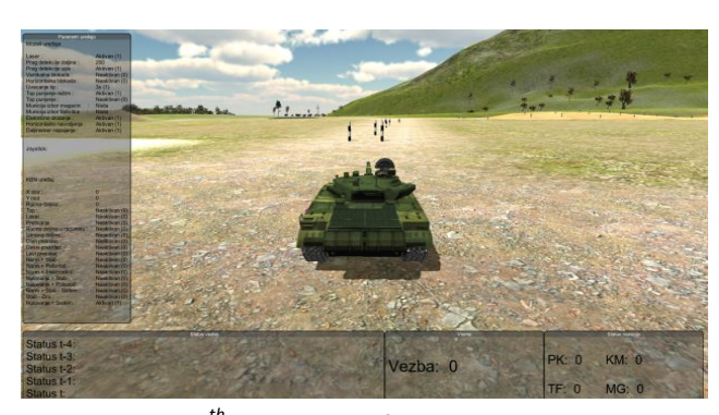
3<sup>th</sup> person view for instructor